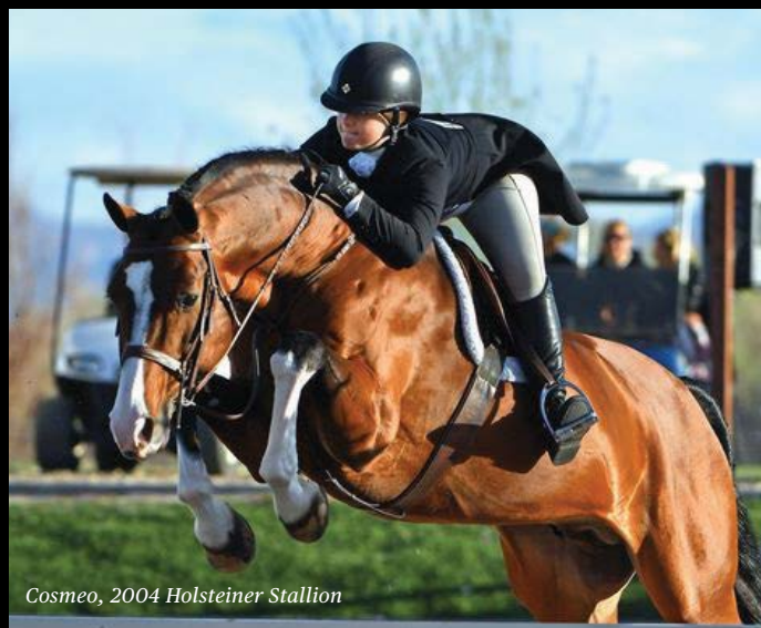
Cosmeo, 2004 Holsteiner Stallion

4561 Iron Works Pike, Suite #155 Lexington, KY 40511