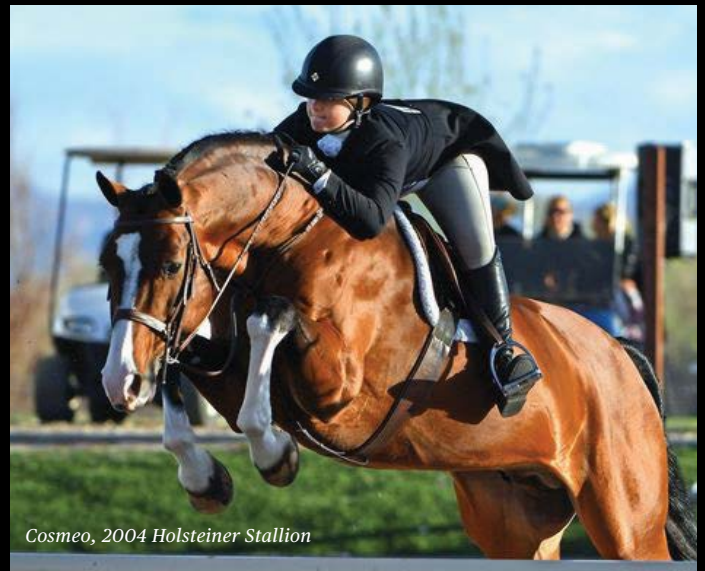
Cosmeo, 2004 Holsteiner Stallion

4561 Iron Works Pike, Suite #155 Lexington, KY 40511