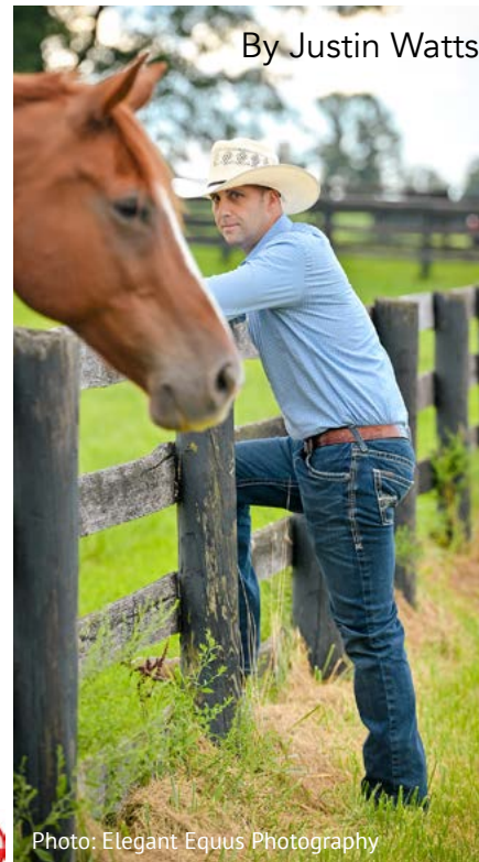
By Justin Watts

But the crux to all of this layering goes back to the horses