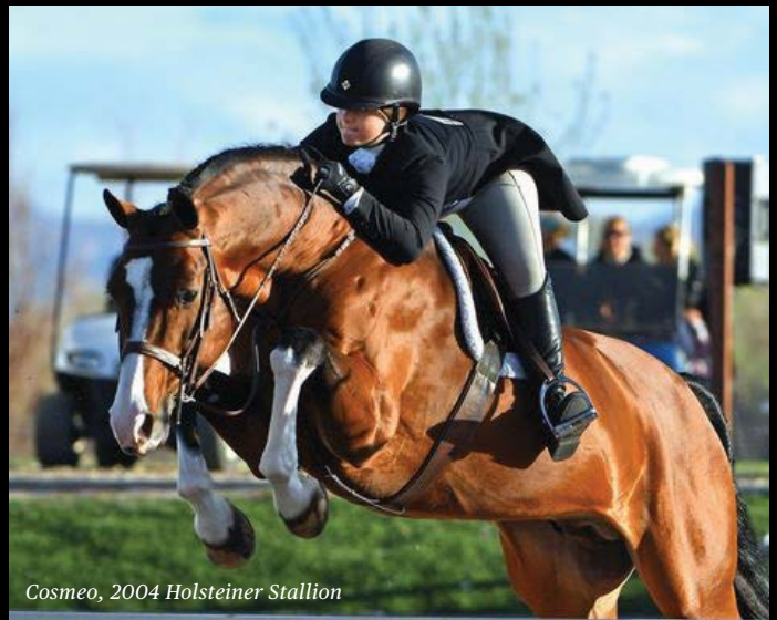
Cosmo, 2004 Holsteiner Stallion

4561 Iron Works Pike, Suite #155 Lexington, KY 40511